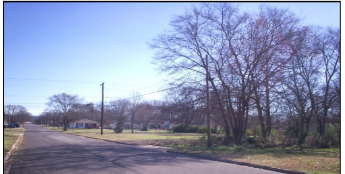
The mission is not over, we have more land to claim. Land Drive Phase II continues 2009