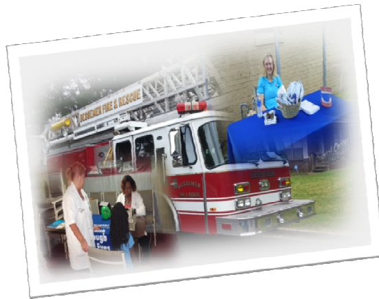
These vendors provided gifts packages and valuable information for both adults and kids.

We'd like to thank our vendors who took the time come out and support our event: City of Bessemer and the Bessemer Fire Dept, Walmart Vision Center, Sarrell Dental Center, Sickle Foundation, American Cancer Society and Regions Bank.