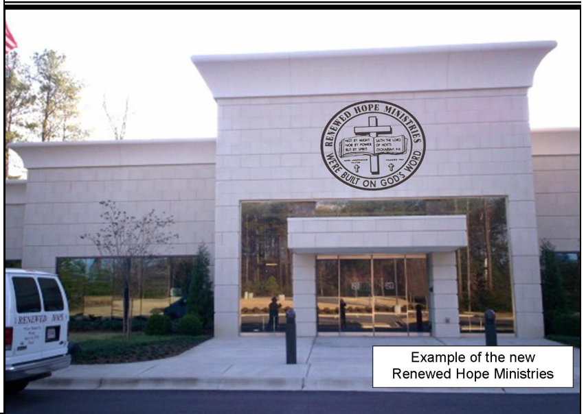
Example of the new Renewed Hope Ministries

All RHM Helps Ministries we need your help in keeping us informed of activities going on in your department. Contact a member of the PM when you plan new events, meetings, activities or announcements.